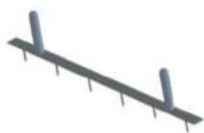
I Brake Tackle