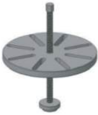
Hub Puller K7 & K9