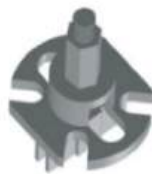
Valve Spring Compressor