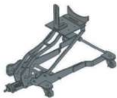
Motor Removing Trolley from Vehicle Level