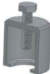
Ball Joint Puller