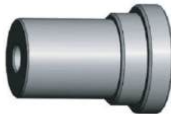
Needle Bearing Remover Tool