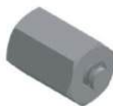
Fuel System Isolator Tool