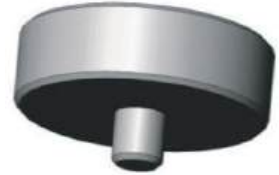
King Pin Installer