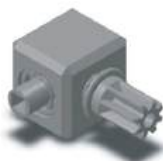
Flywheel Locking Tool for SAE1 Housing