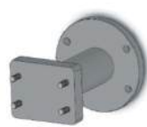
Engine Mounting Bracket for B6.7 Engine