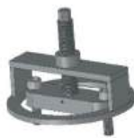
Rear Crankshaft Oil Seal Installer & Remover