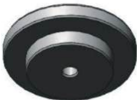
Hub Oil Seal Installer