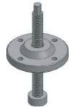
Air Compressor Fan Remover Tool