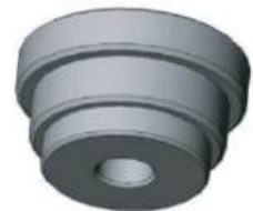
Needle Bearing Installer Tool