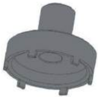
Chuck Nut Removal Tool K9 New Model