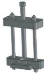
King Pin Remover